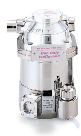
Isoflurane VIP 3000°

The choice of veterinary professionals, the VIP 3000° uses proven design principles to ensure output concentration is virtually unaffected by flow rate, temperature variations, duration of use, liquid level or back pressure fluctuation within its clinical range.