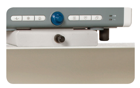
Cardell® Monitor Mount with VMS® Plus