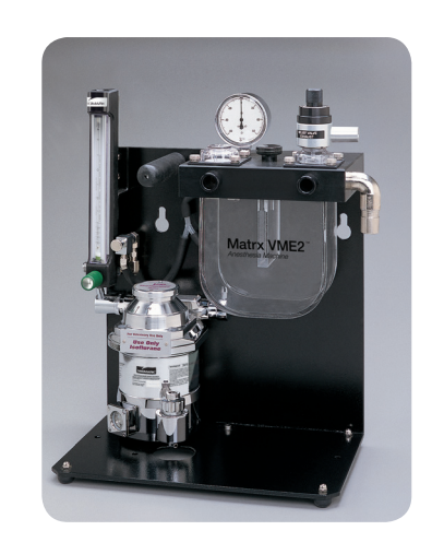
Matrx VME* Tabletop/Wall Mount System Flexibility and performance at an economical price. The convenient carry handle with soft vinyl grip allows for easy mobility.

Have peace of mind knowing that over 50 years of manufacturing experience goes into every Matrx<sup>™</sup> anesthesia machine.