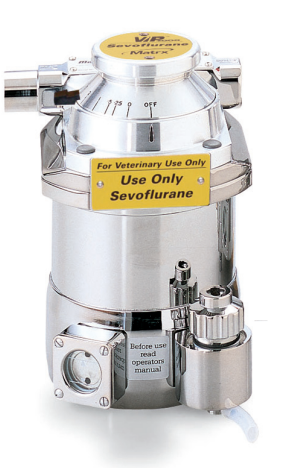
Sevoflurane VIP 3000°

The choice of veterinary professionals for accurate, controlled anesthesia delivery under all conditions.