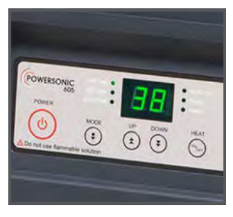
Simple control panel with digital display to set mode and control operation values