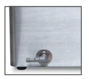
Rear drain valve allows connection of hose for easy removal of cleaning solution

Kleentek cleaners are designed to operate only with non-flammable water-based solutions. We recommend the use of Kleentek's specialised range of chemical solutions with your Powersonic unit.