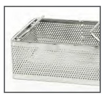
Included is a perforated basket, with additional specialty accessories available