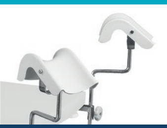
Pair of legrests Ref. 840