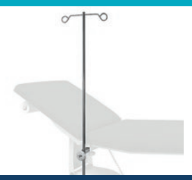
IV pole with 2 hooks Ref. 985-01