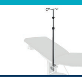
Auto-locking IV pole with 2 hooks Ref. 2985-01